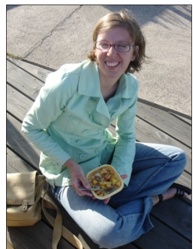
On an outing with my parents

This summer I have been working in an old-peoples home and I have really enjoyed that. One day I was going to work and than I realised I was looking forward to going to work. And than I remembered that I had prayed for me to enjoy my job and not just wait for time to pass. I haven't like working so much before. That was really encouraging. Now I live in my little appartment that my dad and brother built in my brother's basement. It became really nice, two rooms, kitchen, bathroom and shower. My brother and his wife have been such a blessing and it is great fun to have my nephews just pop in from time to time. I feel so blessed!